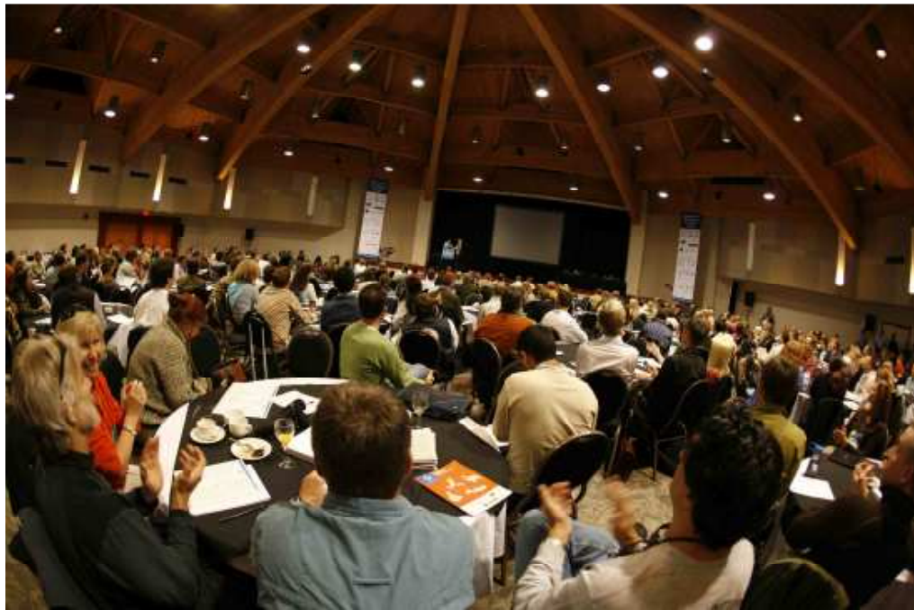
ATWS delegates represented 35 nations from around the globe, including Brazil, Canada, China, Croatia, England, Jordan, Norway, Switzerland, Thailand, Spain, New Zealand, Trinidad and Tobago, The United States, and Uzbekistan.

*‘Other’ includes volunteers, ATTA staff, government agencies, and individuals.